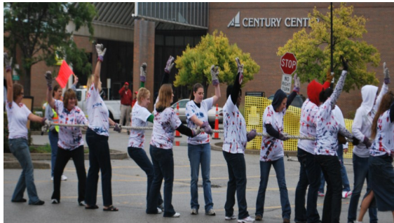
Navarre IC and partner Gibson Ins.-Winner of the Women's Fastest Pull!

Note: The above information is reported from our annual audit statement of functional expenses. This report and 990 are available on the website: www.edfo.org Click on the financial tab.