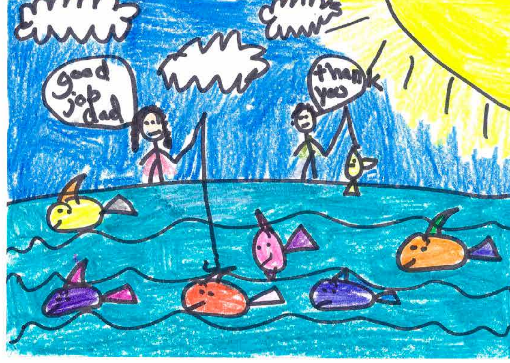
ILLUSTRATION BY CAMRYN, WARREN PRIMARY CENTER