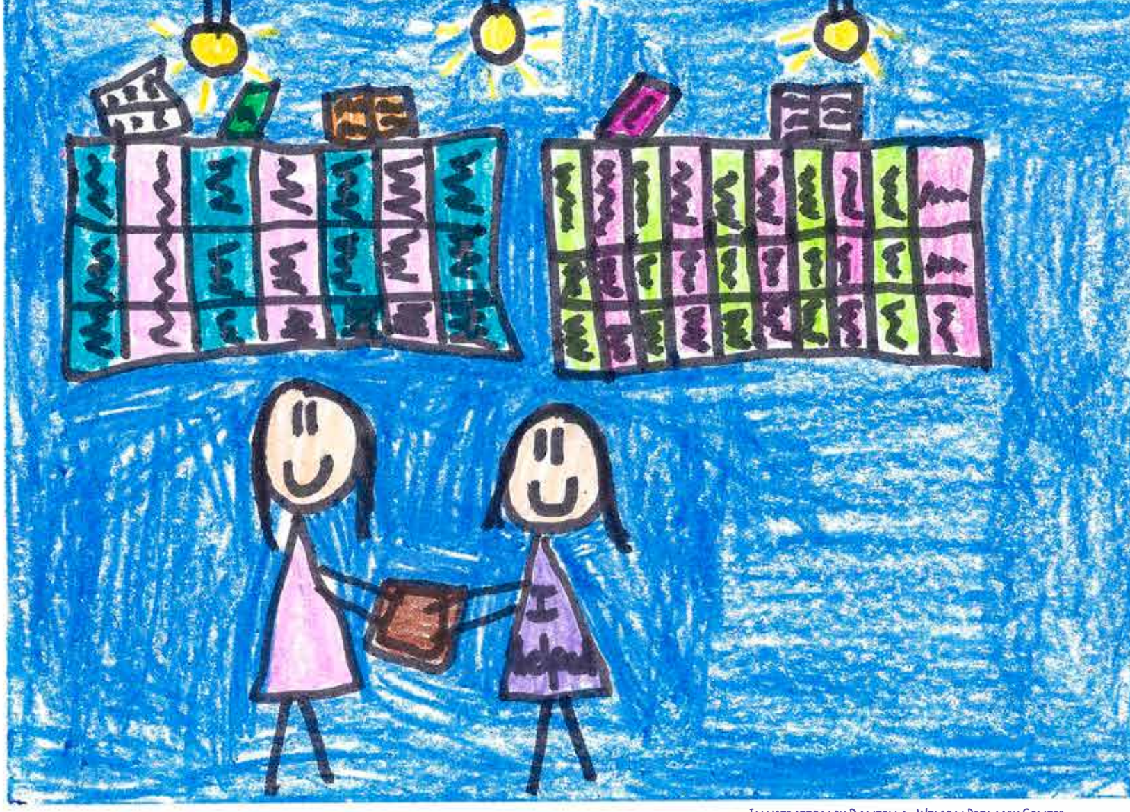
ILLUSTRATION BY DANIELLA, WILSON PRIMARY CENTER