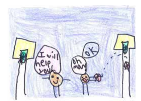
ILLUSTRATED BY KISHAWN, WILSON P.C.