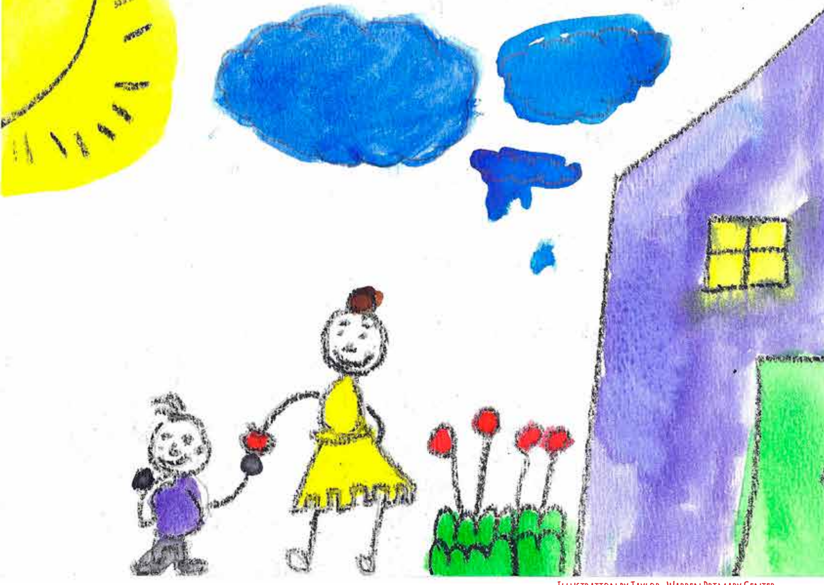
ILLUSTRATION BY TAYLOR, WARREN PRIMARY CENTER